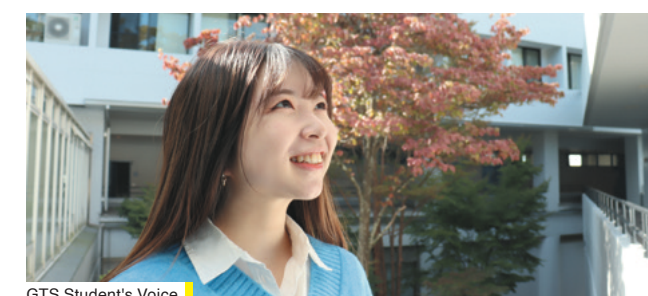
GTS Student's Voice

Academic English Program is a set of foundational courses in liberal arts education. Through a content and language integrated (CLIL) approach, students develop academic English skills necessary to thrive in English medium instruction courses in the GTS program and abroad. Some of our courses include Capstone Project, Rhetoric & Research Writing, and Presentation & Seminar Skills.